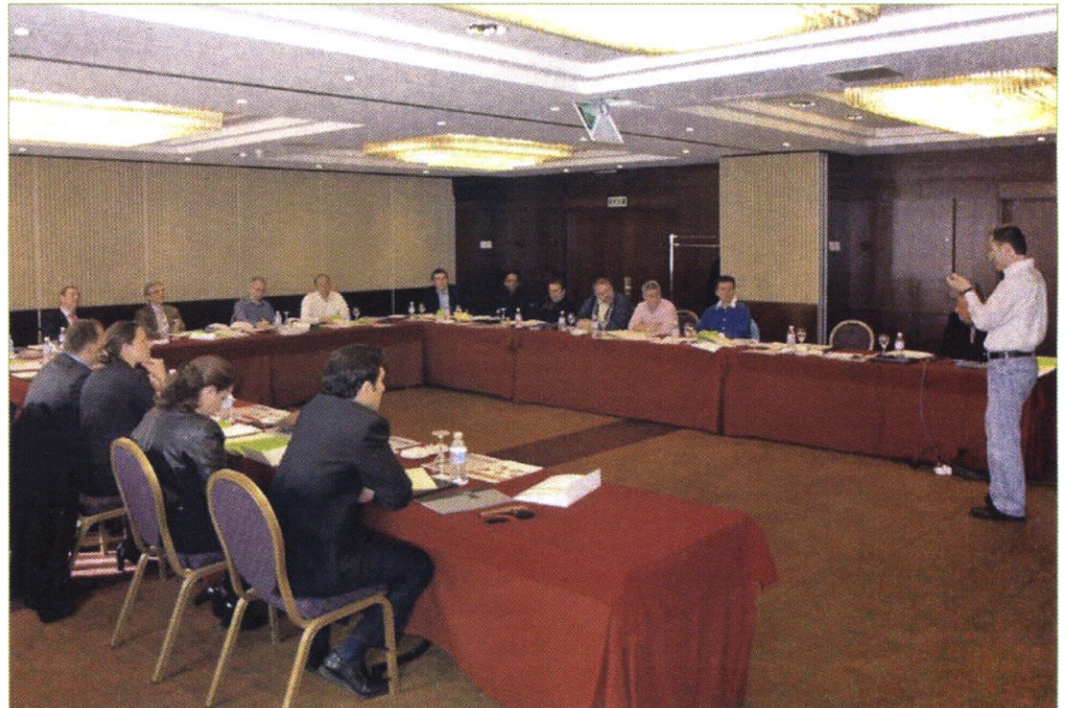
The conference of the GGI Practice Group International Taxation took place in Majorca.